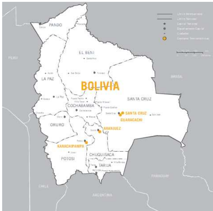
Map of Bolivia showing the location of Guaracachi's power plants 50

which three of ENDE's thermal power stations were transferred: Guaracachi, Aranjuez and Karachipampa, shown on the map below. 49