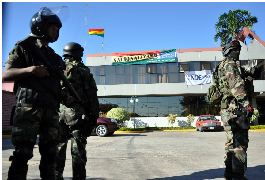
Nationalization of Guaracachi on 1 May 2010 (El Deber) 154